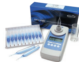
Ozone SAM Test Kit