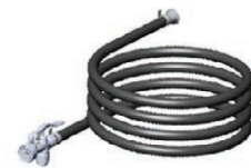
Hose and Spray Nozzle

(Accessories available at pacificozone.com )